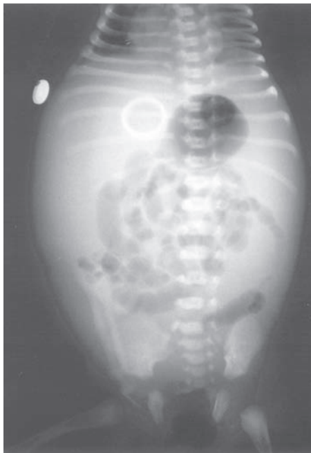
Fig. 1. Abdominal X-ray reveals the presence of ascitic fluid in the abdomen.

insufficiency. The cystogram detected a diffuse extravasation of the contrast material in the peritoneal cavity, confirming the diagnosis of a urinary ascites due to the bladder rupture (Fig. 2). Conservative management with bladder catheterization was decided as initial treatment. The neonate's clinical condition and