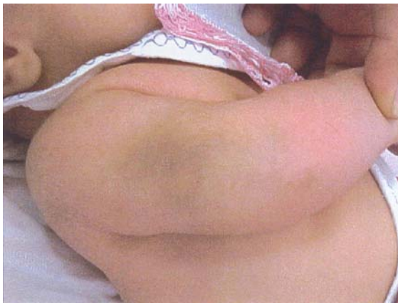
Fig. 2. Deltoid area of the patient.

suffered anemia; hemoglobin concentration of 7.7 g/dl, hematocrit 22%. The platelet number checked for hemorrhage etiology was normal 415,000/mm 3 . Alanine aminotransferase (ALT) 19 U/L, aspartate aminotransferase (AST) 32 U/L and total direct bilirubin levels were within normal limits (1.24 mg/dl and 0.24 mg/dl, respectively). Cranial computed tomography (CT) revealed multiple intracerebral hemorrhages (Fig. 3). We suspected bleeding as a result of vitamin K deficiency. She was hospitalized, received 3 mg vitamin K intravenously and was transfused with a packed erythrocyte suspension and fresh frozen plasma. After this therapeutic approach, control laboratory investigation revealed INR and aPTT within normal limits, 1.19 and 31.7 seconds,