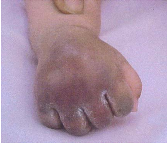
Fig. 1. Right hand of the patient.