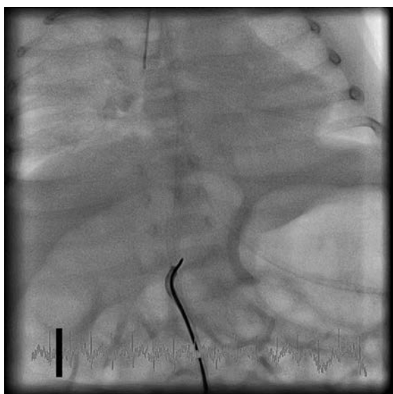
Fig. 2. Catheter piece; its lower end was caught by snare and it was removed from right femoral vein with the sheath without any complication.

unsuccessful and the patient was referred to our center. The catheter piece was stuck between hepatic vein and right upper pulmonary vein. The patient was taken to the catheter laboratory and under general anesthesia, five French sheath was percutaneously inserted in right femoral vein. A pigtail catheter was advanced to the right atrium and we tried to catch and pull the catheter piece to the right atrium but it got free of the pigtail catheter. Then another