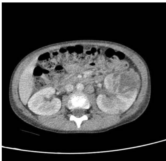
Fig. 1. Abdominal CT of the patient at the onset of the treatment. Lobar nephronia of the left kidney is apparent.

The presence of clinical manifestations such as high fever, flank pain and pyuria suggests the diagnosis of AFBN. However, small children might not express flank pain and present with nonspecific symptoms like vomiting, diarrhea, dehydration, and paraumbilical pain. Because of these nonspecific symptoms, diagnosis of AFBN might be overlooked. In one study, 25 patients with AFBN had been evaluated, and the authors reported that these patients had presented with complaints of meningitis (n=4), urinary tract infection (n=5), renal tumor (n=3), pneumonia (n=2), and appendicitis (n=1). Still, in the same publication, the authors indicated that only 10 patients, with a mean age of 8 years, could express flank pain. Before referrals, in 21 of 25 children, upper respiratory tract infection (n=5), pneumonia (n=3), tonsillitis (n=5), urinary tract infection (n=5), gastroenteritis (n=1), mandibular abscess (n=1), and serious dental caries (n=4) were detected 4 . Before his referral to the hospital, our patient had suffered from recurrent otitis media episodes.